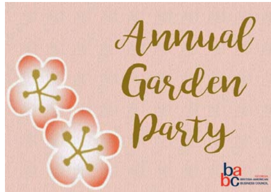
BABC-Georgia Annual Garden Party