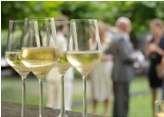
BABA Washington British Embassy Residence Garden Party