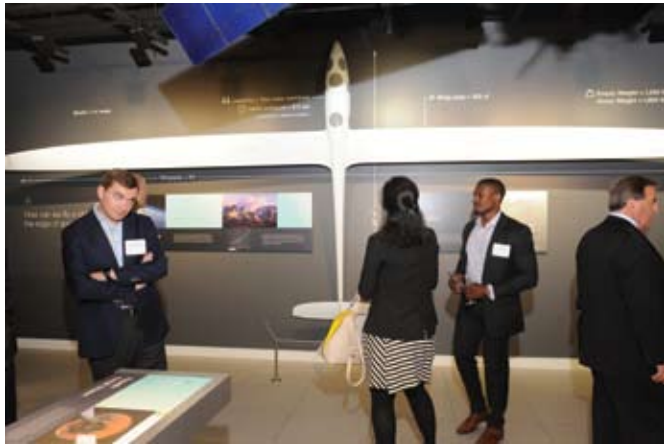
Guests take in the tour of the Airbus Experience Center in Washington.

All BABA event photos can be viewed at www.babawashington.org