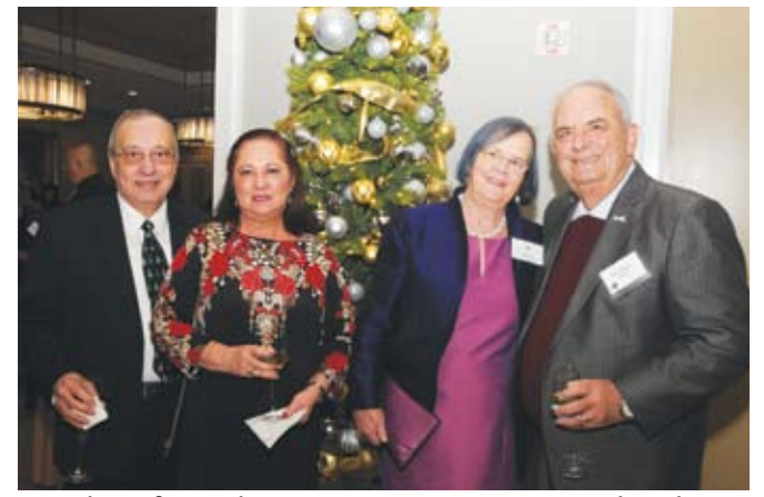
Members from Platinum event sponsor, OBXtek, take in the festivities.