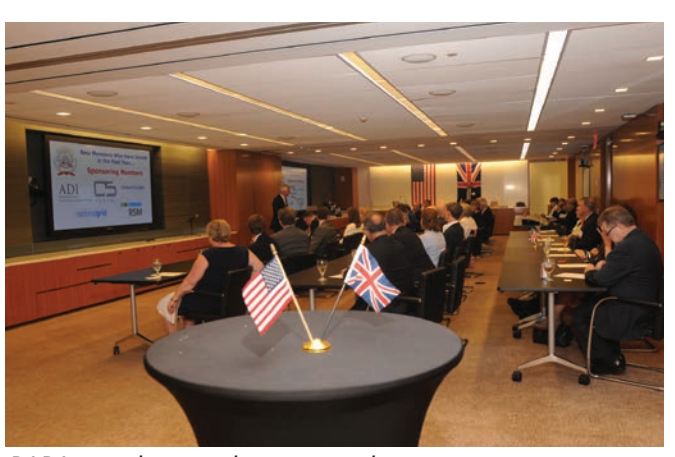
BABA members and guests at the event.