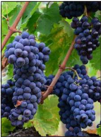
On Page 6 BABA's Virtual Wine Tastings