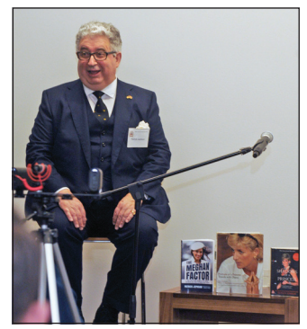
Page 6 – Bestselling author discusses the Royals and Brand Messaging