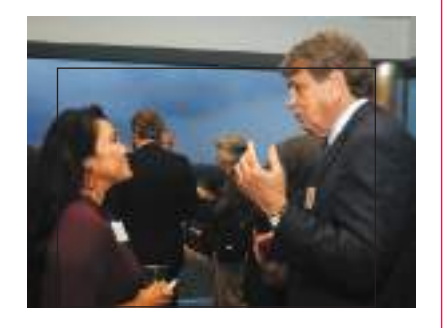
Page 4: "Back in-person' networking evening held on October 25