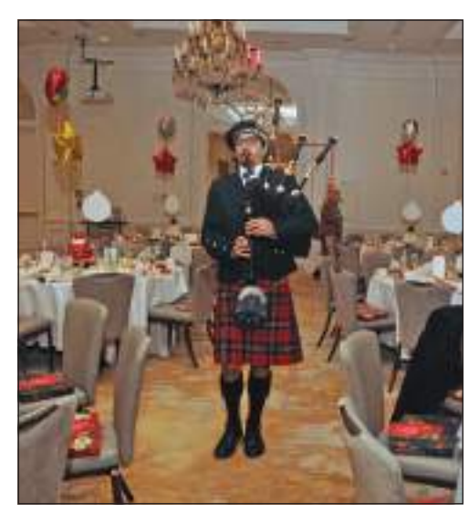
Piping our guests into the Ballroom.