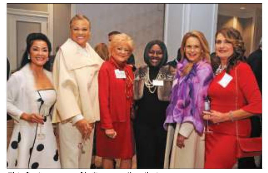
This festive group of ladies are all smiles!